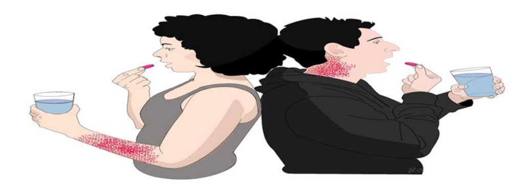
Figure 1. The correlation between gender and drug allergy (Illustrated by Yücel Özalp).

It should be stated that there might be differences due to gender in treatments in addition to drug allergies and that treatments might be made more effective with personalized treatment (6). This study was conducted to evaluate the correlation between gender, and drug allergy agent and its incidence frequency (Figure 1).