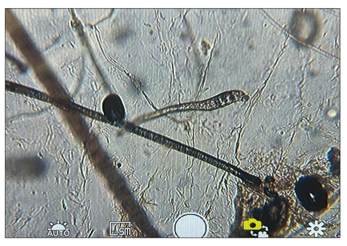
Figure 3 : Demodex mites in the azelaic acid group. The eversion of the lateral structures led to a linear appearance concurrent with the end of movement.

In another study, we recently compared the in vitro Demodex killing activity of tea tree oil to that of permethrin (23). During the experiments, only the permethrin group had notable findings suggesting morphological degeneration, even fragmentation (23). None of the samples in the tea tree oil groups demonstrated these findings. Thus, the morphological features were also examined in detail in the present study. Upon morphological evaluation of Demodex mites, degeneration findings were observed only in the permethrin group. These findings differed between the early stage and late stage. On the other hand, the