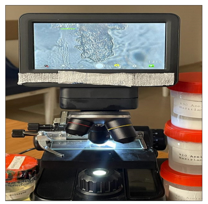
Figure 1. The digital microscope enabling the continuous observation of Demodex movements

All of the mites included in the study were Demodex folliculorum . The study did not include Demodex brevis mites, which were rarely observed in SSSB samples. All 80 mites exposed to the active treatment solutions except those in the control group (immersion oil) were completely free of movement within the first 20 minutes of exposure (min-max: 10-18 minutes). Mean ST was 15.85±1.6, 14.05±1.5, and 12±1.2 minutes in the 10%, 20%, and 30% azelaic acid groups, respectively. The differences between the three groups did not reach statistical significance (p>0.05) (Table 1). The mean ST was 12.2±1.5 minutes in the 5% permethrin group. In the comparative evaluation of the permethrin group with the azelaic acid groups, no difference was observed in terms of ST (p>0.05) (Table 1). The mean ST of the control group was 197±23.6 minutes.