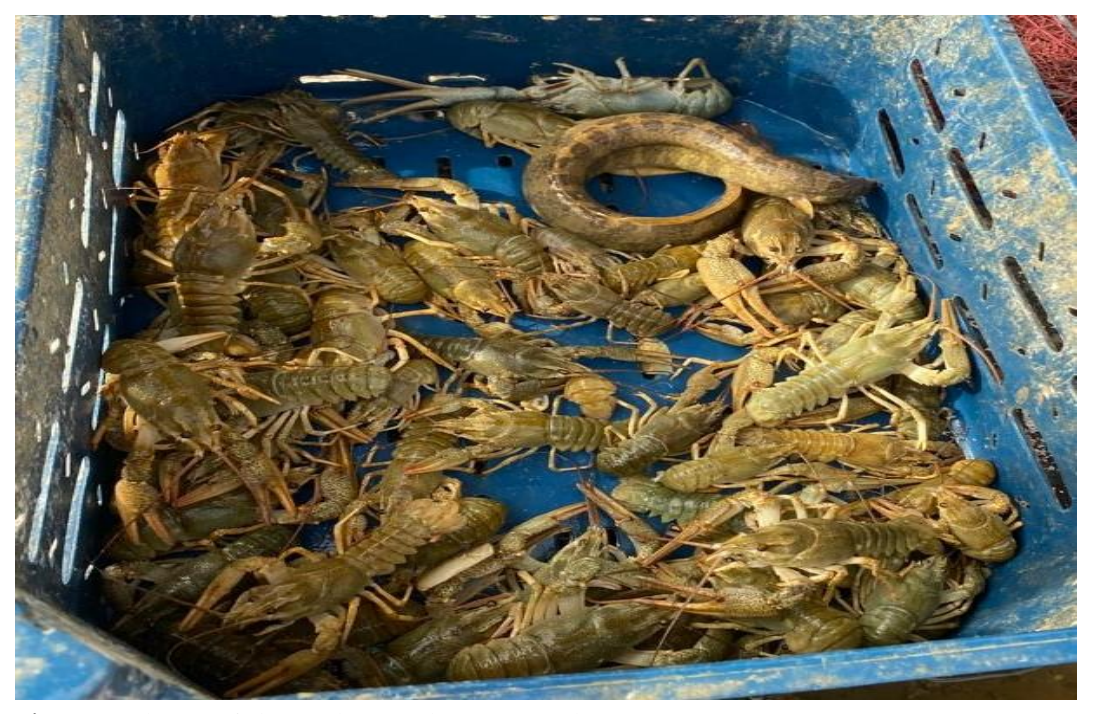
Figure 3. The crayfish caught in Keban Dam Lake (Ağın region).

10 of 13 fishermen in Ağın region, 8 of 16 fishermen in Keban region, 9 of 32 fishermen in Çemişgezek region, 2 of 7 fishermen in Kemaliye region, and 16 of 18 fishermen in Aydıncık region also fish for crayfish. Crayfish caught in Keban Dam Lake are offered for sale with a length of 10 cm and longer. It was observed that the fykenets used for catching crayfish also catch non-target fish species such as Mastacembelus mastacembelus (Figure 3).