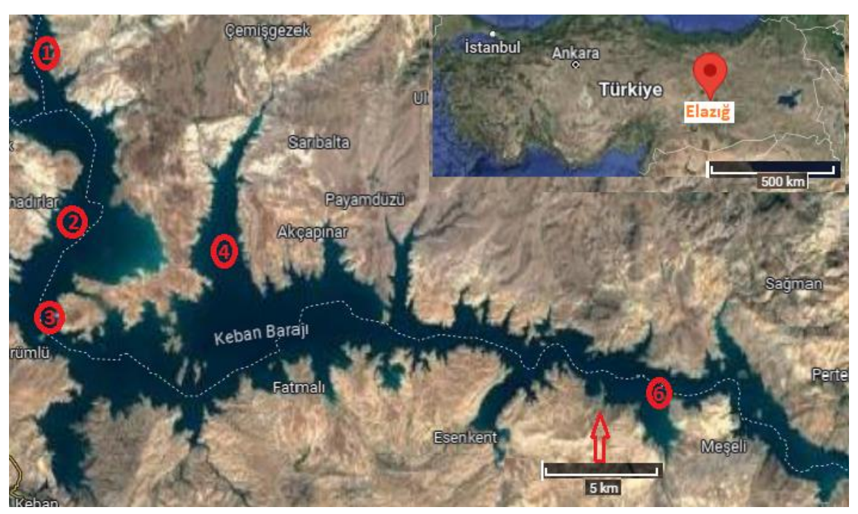
Figure 1 . Keban Dam Lake (Elazığ), crayfish fishery regions 1st fishery area (Kemaliye), 2nd fishery area (Ağın), 3rd fishery area (Keban) and 4th fishery area (Çemişgezek) and 6th fishery area (Aydıncık) regions.

Catch per unit effort (CPUE) was calculated as grams of crayfish per fykenet per day, considering the duration the fishermen kept their fykenet in the water. Yields per hectare and per boat were computed. Furthermore, the study examined the reasons why fishermen in the region prefer crayfish fishing and assessed the challenges they encounter. The results were then analyzed.