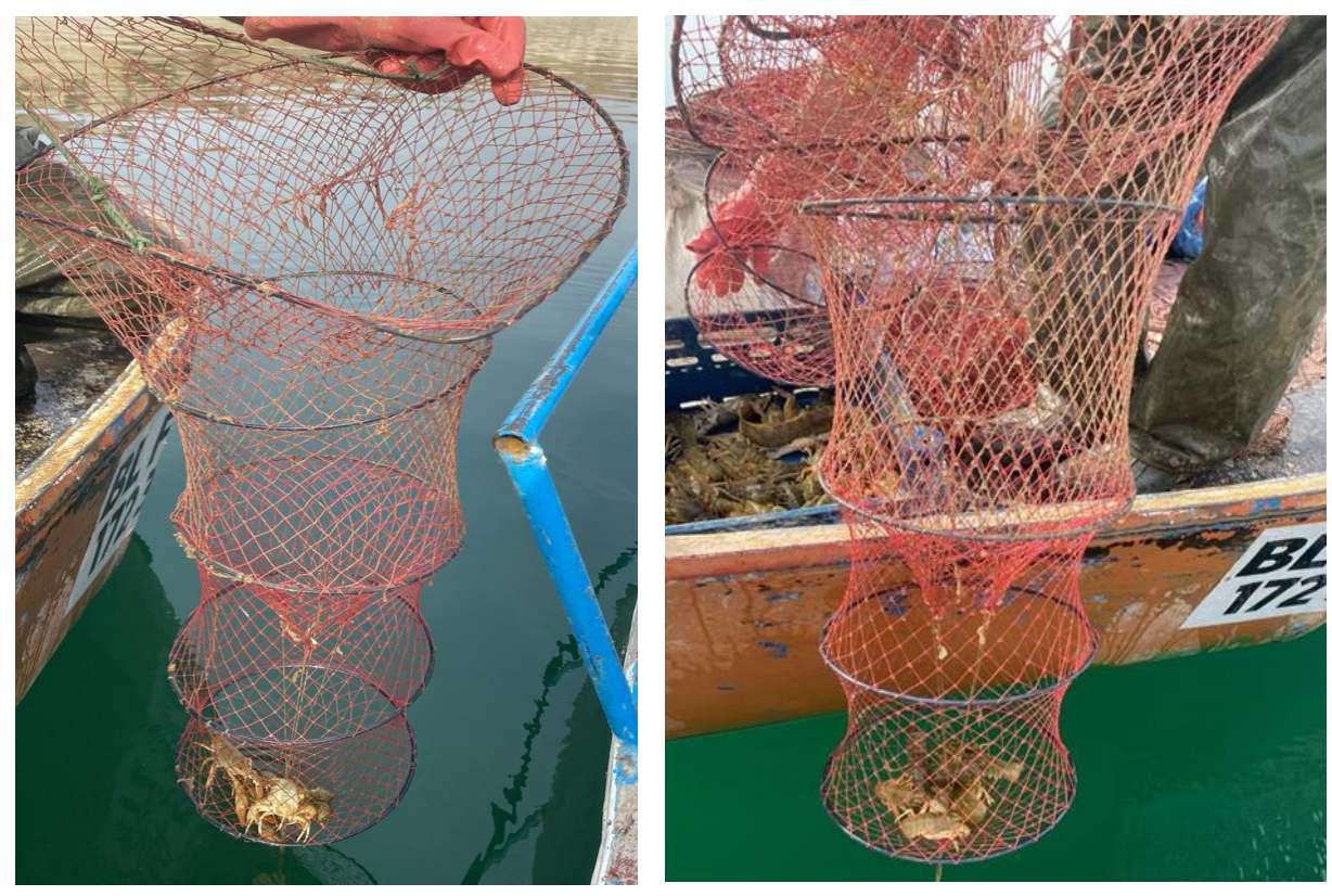
Figure 2. The D-shaped (4-circle) fykenets used in crayfish fishing (2023 Crayfish season).

10 of 13 fishermen in Ağın region, 8 of 16 fishermen in Keban region, 9 of 32 fishermen in Çemişgezek region, 2 of 7 fishermen in Kemaliye region, and 16 of 18 fishermen in Aydıncık region also fish for crayfish. Crayfish caught in Keban Dam Lake are offered for sale with a length of 10 cm and longer. It was observed that the fykenets used for catching crayfish also catch non-target fish species such as Mastacembelus mastacembelus (Figure 3).