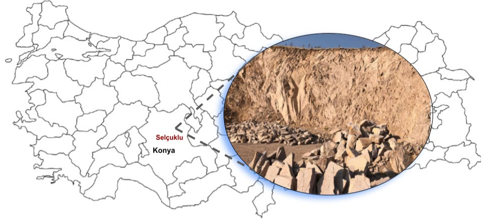
Figure 1. Sille stone Source

In this study, Sille stone samples are kept in water, in nitric acid (HNO<sub>3</sub>) prepared as 1 molar, in the atmosphere environment, coated with stone varnish and uncoated for Sille stone for 6 months. Mechanical and chemical changes of Sille stones during seasonal transitions were analysed over a 6-month period.