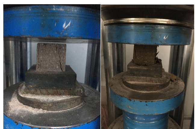
Figure 1. The compressive strength test of the samples

The pressure test was prepared depending on TS 1926 conditions and its procedure. Test for compressive strength is carried out on a 7x7x7 cm<sup>3</sup> cube. So, Sille stone test samples were prepared as cube samples with dimensions of 7x7x7 cm<sup>3</sup>. Before placing the sample on the compression device with adjusted loading speed, it was checked that the surface on which the sample would be placed was clean and smooth. The sample was carefully placed on the testing device in the centre of the loading bed so that the load would act exactly in the middle and axially. After the placement process was completed, loading was started and the maximum force withstood by the sample was measured from the device (Figure 1). The compression test was carried out with the compression device in the civil engineering laboratory of Necmettin Erbakan University.