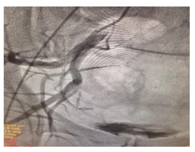
Figure 1. Angiogram shows concentric stenosis in the middle part of the right pudendal artery

Erection has a complicated neurovascular mechanism. When evaluating the diagnosis of ED, it should be usually considered as multifactorial. The use of validated questionnaires such as the IIEF-5 should be taken account when evaluating the patient for ED (5). PDUS is a reliable and noninvasive diagnostic method for assessing ED for objective measurement of the blood flow of the penis. Maximum smooth muscle relaxation is achieved by pharmacological erection before Doppler ultrasound. It is accepted as arterial insufficiency if the right or left cavernosal artery peak systolic velocities are less than 30 cm/sec. End-diastolic velocity values greater than 5 cm/sec on ultrasound are defined as veno-occlusive dysfunction and exclude the patient from being a candidate for penile revascularization surgery (6).