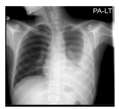
Figure 1. Pleural effusion in left hemithorax (Damoiseau line )