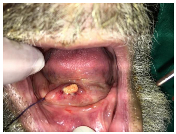
Figure 3. It is showed the removal of the sialolith.