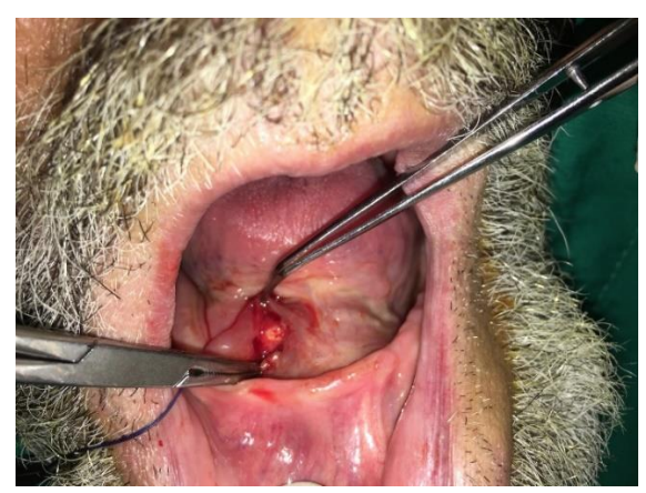
Figure 2. The duct was sutured by posterior of the sialolith. After blunt disection, the sialolith was identified.